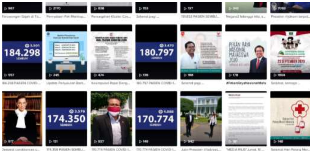
Figure 2. TikTok page of the first informant

The difference in display is seen in the second informant who tends to display a more formal situation. However, in some videos, the formal appearance is used as a physical identity. The behavior in the videos of the second informant has a variety of content in the form of personal opinions, entertainment videos and information.