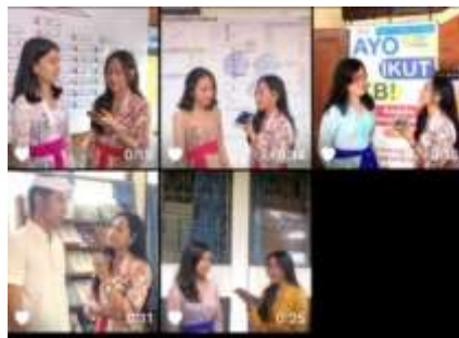
Image 2. Myth or Fact Videos for Tiktok Content

The questions chosen were 1) Having sex just once will not cause pregnancy is a myth or fact, 2) Men and women must have the same thoughts and way of life in order to get married is a myth or fact, 3) Having sex once is too early can cause cervical cancer is a myth or fact, 4) Condoms can prevent pregnancy up to 100% is a myth or fact, 5) Teenage pregnancy can harm the mother and fetus is a myth or fact.