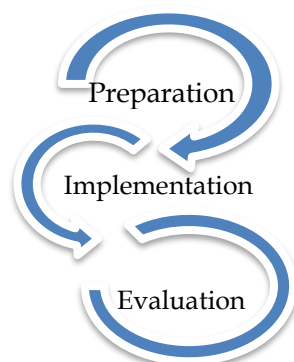
Figure 3. The Stages of Implementing Activities

The final stage of this PKM activity is the evaluation of the implementation of activities and sustainability of the program. The evaluation stage was carried out during the socialization of the Pokdarwis website using a questionnaire. The scale used is a Likert scale with a range of 1-5. The measurement is from very poor on a scale of 1, and very good on a scale of 5. Evaluation is carried out to measure the success of the implementation of socialization activities. The first indicator of evaluation includes methods, coordination, cooperation, and benefits of organizing socialization. The second indicator relates to the socialization material with includes the quality, actualization, novelty and exclusivity of the material. The third indicator is the evaluation of the quality of the resource persons. The stages of implementing this PKM are listed in Figure 3, as follows: