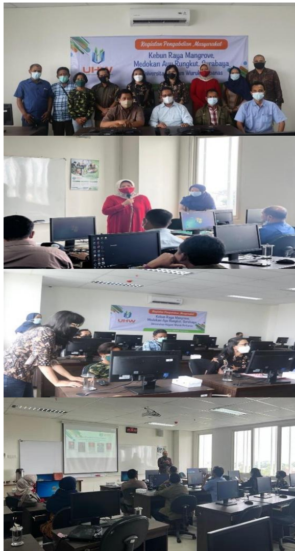
Figure 6. Website Socialization

Evaluation of the implementation of Pokdarwis website socialization, the average rating of participants in the range of 4.4 to 5. The assessment is in the good to very good category. The socialization of the Medokan Ayu Pokdarwis website received a good rating and several participants hoped for the continuation of the activity.