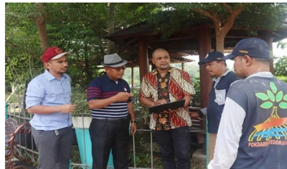
Figure 2. Initial Discussion with Pokdarwis

The main target of this community partnership activity is the Medokan Ayu Pokdarwis, which includes the board all its members. The stages implementing this PKM are preparation, implementation of activities, and evaluation. The preparation stage was carried out through discussion with the chairman and secretary of Pokdarwis Medokan Ayu. The aim is to formulate problems from Pokdarwis as well as to know the needs and aspirations of Pokdarwis related to the use of information technology systems in the management of the Medokan Ayu Mangrove Botanical Gardens.