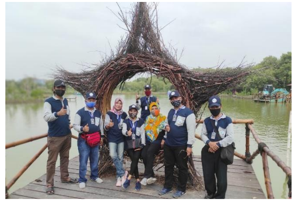
Figure 1. Mangrove Medokan Ayu

The management of Pokdarwis Medokan Ayu argues that they need to use technology related to the management of the organization. These needs and wants are based on the condition of the Covid-19 pandemic. This condition has changed the management's perspective, specifically regarding the application of health protocols to maintain social distance. The implementation of social distancing has an impact on decreasing the number of visitors to the Medokan Ayu Mangrove Garden. Based on information from one of the administrators, the average visit rate before the pandemic was 200-500 visitors. The peak of visitors is on weekends and during holidays. The Medokan Ayu Mangrove Botanical Garden has natural beauty that blends with the blue sky. The Medokan Ayu Mangrove presents natural potential and unspoiled fauna and mangroves. Tourists can enjoy ponds overgrown with unspoiled mangrove trees (Susanti, Safeyah, & Mutia, 2021). However, since the beginning of 2020 as the start of the Covid-19 pandemic in Indonesia, the number of visitors has fallen drastically by around 60%. The peak of the decline occurred in the period of July, 2021 until finally the Medokan Ayu Mangrove management decided to temporarily close the ecotourism of the Mangrove Botanical Garden.