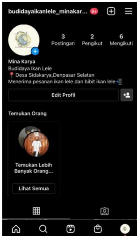
Image 3. The Instagram Account of Catfish Cultivation Business in Sidakarya Village

training session of how to create an account of social media with the management. It begun with Instagram account, then Google Maps. The Instagram account used by the management to market the product meanwhile the Google Maps account used in order to make it easier for the potential buyer to find the location of the business. Here are the Instagram account and Google Maps account of Catfish Cultivation Business in Sidakarya Village.