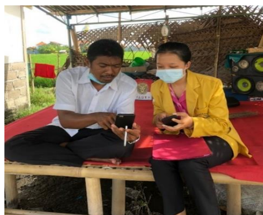
Image 2. The Interview and Socialising about Social media to the Manager of Catfish Cultivation Business

Choosing the Instagram and Google Maps as media to promote because Instagram is still the top media and used by high number of users, moreover Google Maps was chosen since it was easier for the new consumers to find the location.