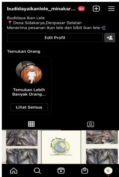
Image 6. The Example of Product Display on Instagram