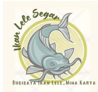
Image 5. The Logo of Catfish Cultivation Business

The purpose of this activity was to make the business has unique characteristic or identity to represent the business. It was one of the important components for the business since it presented the product image. With an interesting logo, the consumer will be attracted to the product by seeing the interesting logo. In marketing, the logo means to improve the product presentation to the society through advertisement.