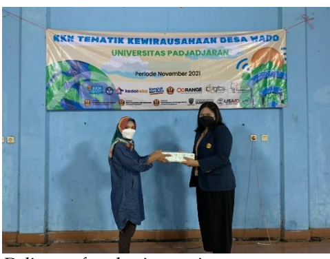
Figure 9. Delivery of packaging equipment

For the implementation of the review, the PPM team controls marketing activities by coordinating with business actors, from productivity to profits. This review aims to improve products, attract buyers, and extend the length of business, in order to get an impact in the form of MSME Crackers Bangreng having increasing interest and a marketing system that is gradually progressing through coaching, training, and coordination with business actors. In addition, this activity discusses one by one related to the importance of packaging of a product to attract consumers' attention, tips on making attractive packaging, giving examples of packaging from other related MSMEs. The PPM team also had the opportunity to provide packaging equipments to MSMEs (Figure 9).