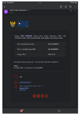
Figure 5. MSME Crackers Bangreng has been registered on