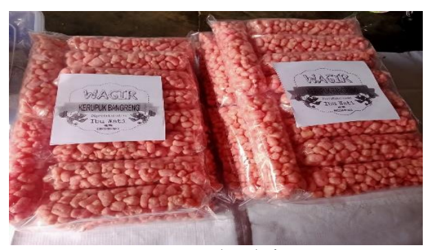
Figure 10. Bangreng crackers before innovation

attached with the help of a candle flame. The inclusion of shrimp paste in the bangreng bu wati cracker's recipe gives the crackers a pink color. There are just original tastes available. The price is very cheap for 5 pieces of small plastic packaging priced at IDR 2,000, and there is no packaging label. A standing pouch with full color lamination and an aluminum foil package with ziplock, size 15 cm x 20 cm with a net weight unit of 60 grams was used by the PPM team to optimize packing. Additionally, a new logo, composition details, net weight, and flavor variant are added to the packaging label. The PIRT number is also included on the packaging label along with a choice of bangreng cracker flavors, namely original taste, spicy taste, sweet corn flavor and balado flavor (Figure 11). The price of a new package of Bangreng crackers is IDR. 9.000,- per pack. The provision of various flavors is expected to increase the bangreng cracker market segment which was previously only liked by adults, so with this innovation, teenage and child consumers are also the next sales target.