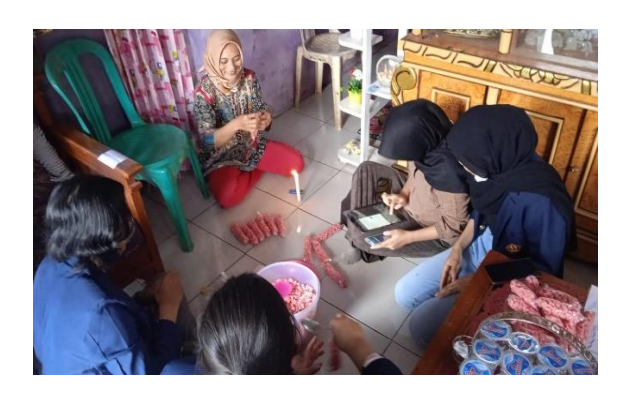
Figure 4. Assistance in the production flow and input of MSME data to the OSS website

Based on the analysis of the situation and problems faced by the Bangreng cracker MSME owners in Wado village, there are several solutions offered. The solution offered by PPM students from Padjadjaran University is to develop Bangreng cracker SMEs in the provision of flavoring, packaging, application of a more complete and attractive logo design, as well as conducting marketing or market tests to attract buyers' attention. Mentoring activities are first carried out by assisting the flow of the production process, in addition to conducting interviews and inputting MSME data into the OSS web to obtain a Business Identification Number (Figure 4).