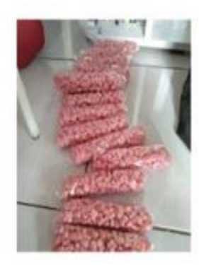
Figure 3. Bangreng Crackers Products