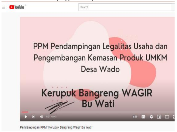
Figure 13. Youtube PPM SME mentoring activities

The expected impact of this activity is that business actors will recognized the value of product innovation and business legality and will use these concepts in accordance with their respective business needs. Hopefully, Bu Wagir's bangreng wagir cracker business in Wado Village will get better quality and increase productivity. All documentation for mentoring activities is uploaded to a youtube video with the link https://www.youtube.com/watch?v=-FYdT0WM4IA (Figure 13).