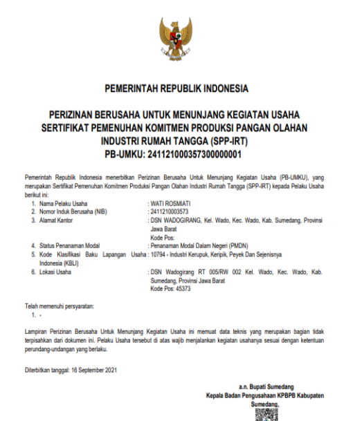
Figure 7. Certificate of Production PIRT MSME