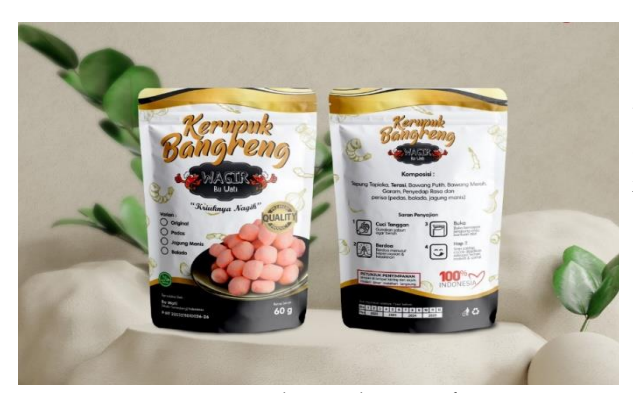
Figure 11. Bangreng cracker packaging after innovation

Through mentoring activities (Figure 12) for one month, the MSMEs of Sumedang Regency, especially the MSMEs of Crackers Bangreng bu Wati can upgrade to class and are ready to go digital market.