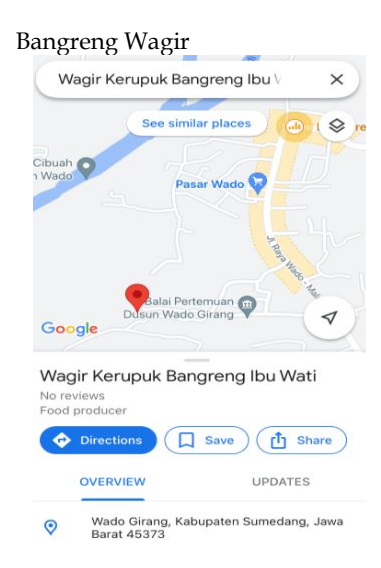
Figure 8. MSME Location Pin on Google Map

For the implementation of the review, the PPM team controls marketing activities by coordinating with business actors, from productivity to profits. This review aims to improve products, attract buyers, and extend the length of business, in order to get an impact in the form of MSME Crackers Bangreng having increasing interest and a marketing system that is gradually progressing through coaching, training, and coordination with business actors. In addition, this activity discusses one by one related to the importance of packaging of a product to attract consumers' attention, tips on making attractive packaging, giving examples of packaging from other related MSMEs. The PPM team also had the opportunity to provide packaging equipments to MSMEs (Figure 9).