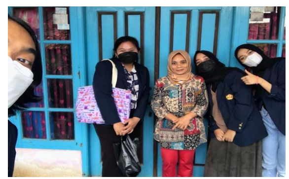
Figure 2. Initial socialization to MSME owners

produce more, therefore a novel approach is required to entice MSMEs to create and market Bangreng crackers.