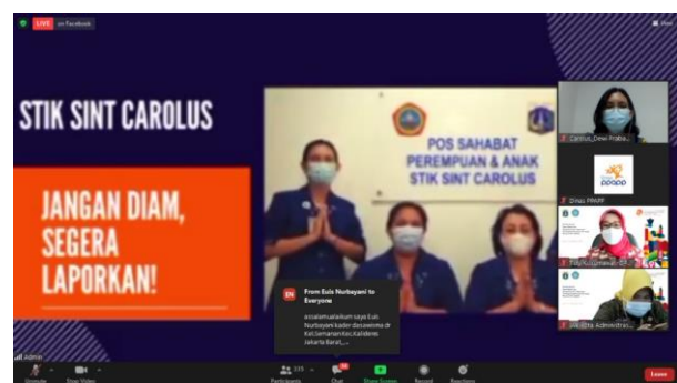
Figure 5. Documentation of soft launching POS SAPA STIK Sint Carolus

STIK Sint Carolus established its first POS SAPA on the Brigitta Building, 1st floor. The strategic location allows the academic community to access this service if they need it. Furthermore, POS SAPA is also planned to be established in collaboration with the Johar Baru District Health Center as the primary target area of the institution as seen at figure 5.