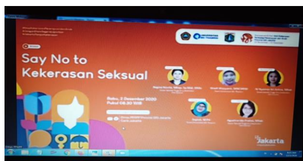
Figure 1. Webinar via Youtube DPPAPP of the DKI Jakarta Provincial Government

Related to the proposed Webinar from DPPAPP, STIK Sint Carolus conducted a webinar with the theme ' Say No to Sexual Violence ' in collaboration with other private universities in Jakarta, which was held on December 2, 2020. The webinar was held using a zoom meeting and broadcast via YouTube as presented at figure 1.