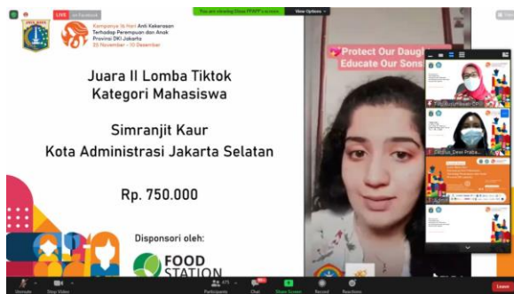
Figure 4. Second place in the TikTok competition by student of STIK Sint Carolus

The cases that are currently emerging are like an expression of the iceberg phenomenon because there are still many victims and their families who have not dared to speak up or dare to take matters to court. Through the message delivered in short TikTok videos, victims and the community are expected to understand better what they are going through and to be open or not afraid to speak up about the sexual violence they have experienced or seen. Finally, they will have the courage to report to the parties dealing with domestic violence problems.