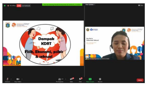
Figure 2. Topic presented by Lecturer from STIK Sint Carolus during webinar

As many as 1,988 participants attended this webinar on YouTube, Facebook, or Zoom channels. Participants came from students, lecturers, Puskesmas officers, cadres and PKK women, other health activists, and the public interested in the topic of 'say no to sexual violence, as