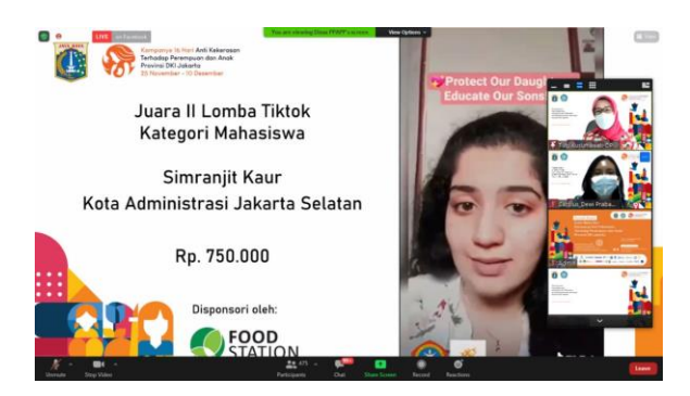
Figure 4. Second place in the TikTok competition by student of STIK Sint Carolus

The cases that are currently emerging are like expression the of iceberg phenomenon because there are still many victims and their families who have not dared to speak up or dare to take matters to court. Through the message delivered in short TikTok videos, victims and the community are expected to understand better what they are going through and to be open or not afraid to speak up about the sexual violence they have experienced or seen. Finally, they will have the courage to report to the parties dealing with domestic violence problems.