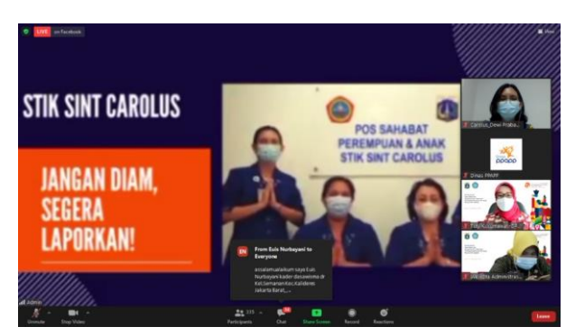
Figure 5. Documentation of soft launching POS SAPA STIK Sint Carolus

STIK Sint Carolus established its first POS SAPA on the Brigitta Building, 1st floor. The strategic location allows the academic community to access this service if they need it. Furthermore, POS SAPA is also planned to be established in collaboration with the Johar Baru District Health Center as the primary target area of the institution as seen at figure 5.