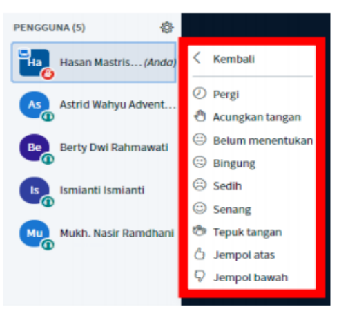
Fig. 3. Emoticon view [27]

Several other usability evaluation methods have been implemented, such as the think-aloud protocol and eye-tracking technology for usability research. Despite its value, analyzing think-aloud sessions can be onerous because it often entails assessing all users' verbalizations [28]. Then, eye tracking is a valuable method for analyzing user behavior and uncovering potential problems with a website or app design. This technique allows an in-depth understanding of how users interact with design elements, including colours, fonts, and layout. It can also help identify what users find most interesting about an app or what they miss completely. In addition to the large amount of valuable data that may be obtained, there are several disadvantages of this method. Users have to perform many actions prior to testing, such as setting up the camera and calibrating the eyetracking software, where calibration can be performed multiple times to obtain precise eyetracking data [29]. The researcher must calibrate the instrument for each respondent. So it can be said that these two methods, think aloud and eye tracking technology, are not worth usability testing because other methods are faster, easier, and more accurate.