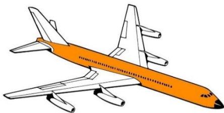
Fig. 2. Aircraft fuselage (orange part)

Waste is anything that has non added value. Waste is excessive beyond the minimum requirements for equipment, materials, components, places, and work time [2]. According to Ohno [3], waste includes eight types such as defect, overproduction, waiting, non-utilized talent transportation, inventory, motion, and extra processing. The waste consists of seven types, including overproduction, waiting, transportation, overprocessing, inventory, motion, and defect [4], [5]. Because the production process is still often found that there is waste that can inhibit the optimization of the production process, various