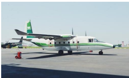
Fig. 1. Civil NC212i aircraft

The fuselage is the main structure or body of an aircraft, and it can be seen in Fig 2. In its assembly, fuselage itself consists of several parts of groups such as fuselage provisioning, fuselage integration, fuselage union, center fuselage, lower panel center fuselage, upper panel center fuselage (FO), upper panel center fuselage (GO), skin panel rear fuselage LH, skin panel rear fuselage RH, upper panel rear fuselage, rear cone, nose fuselage union, nose lower panel structure, nose upper panel structure, and nose radome. In the 117th NC212i aircraft fuselage assembly, it was found that there were symptoms of waste, such as some defects that occurred, the job stop panel, pending material, and others.