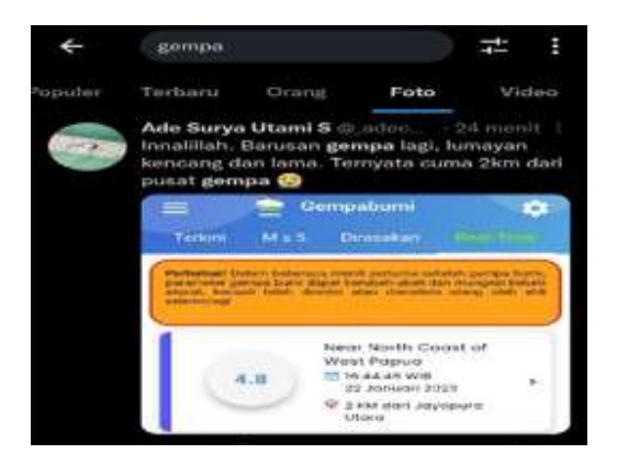
Figure 6. ( Activities User Tagging Twitter. , 2023)

Besides share, Twitter user also does activity tagging or mark something topic with topic labels the with keywords. For example, when user do search about topic earthquake, they stay enter the keyword "EARTHQUAKE" in the column search.