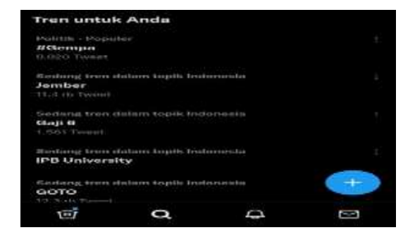
Figure 4. #Earthquakes are ranked first Trending Topic Indonesia when incident earthquake is happened. (Wardani, 2023)

In fact, when earthquake currently on going, #Earthquake is in first rank of trending topics in Indonesia. Trending topic is part from Twitter that shows topic what just discussed by the user at the time. This feature can use for promote certain hashtag in a manner together to show incident latest (Schmidt, 2014). The ratings are in the section trending topic determined from how much lots tweets that include the topic that currently discussed by users Twitter crowded.