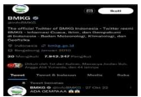
Figure 10. The pin icon with the words ' Embed Tweet ' appears in the order First page beginning @infoBMKG account (@infoBMKG, 2023b)

pinned" feature on Twitter to mark important information that could be missed by Twitter users. Tweets position is on top of first page. The characteristics of the tweet embed is a pin icon with the words ' Pinned Tweet'.