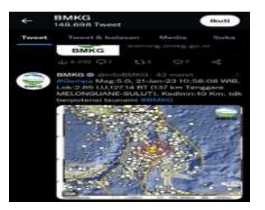
Figure 8. Tweets from @infoBMKG account about disaster natural earthquake and description incident the earthquake that happened. (@infoBMKG, 2023c)

Actually, BMKG has challenge for pack message in a manner short through concise platforms and Twitter. The main reason from the matter is characteristics of Twitter owns limitation character in each tweet uploaded by users is of 140 characters (Southern, 2016). So, BMKG must get around arrangement of words and sentences in each tweet to be displayed to user other Twitter. One of them with use abbreviation for each uploaded tweets without reduce the meaning from message conveyed.