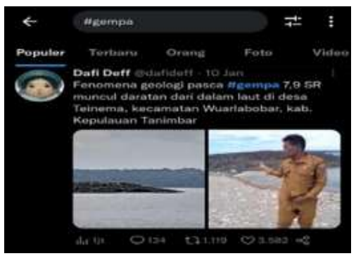
Figure 2. Search results for the keyword #earthquake on Twitter. (Fenomena Geologi Pasca #gempa 7,9 SR Muncul Daratan Dari Dalam Laut Di Desa Teinema, Kecamatan Wuarlabobar, Kab. Kepulauan Tanimbar, 2023)

looks in the eye user other (Hayati & Afriani, 2023).