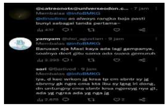
Figure 3. Responses user Twitter on informational tweets disaster natural earthquake from @infoBMKG account. ( Retweet @infobmkg, 2023)

Based on conversation of user Twitter can too give response come back on tweet uploaded by BMKG as well can know development latest from information related earthquake with do click on the hashtag (#) that you already have available. It shows that Twitter capable for the flow of two ways communication between user with different purposes each other and look for information and respond source information from @infoBMKG account with give information addition related topic earthquake.