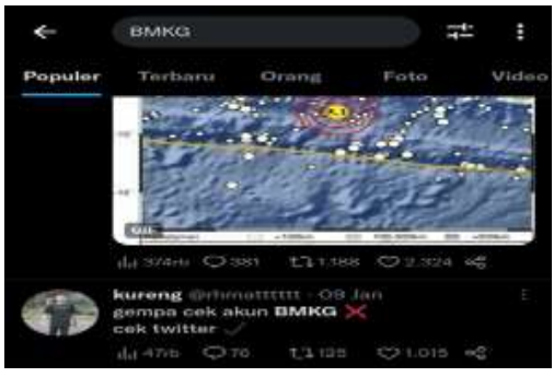
Figure 11. ( BMKG Keyword Search Results, 2023)

According to diffusion innovation theory, the strategy used by BMKG in conveying disaster natural that is earthquakes through Twitter has a purpose for information acceptance faster along with details of what happened in real-time. Without noticed. pubbecomescome being closer with BMKG as а nondepartmental government institution.