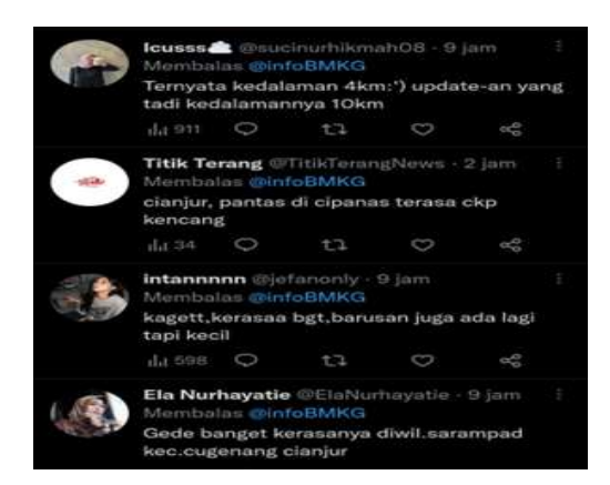
Figure 7. ( Citizen Journalism That Occurs between User Twitter When Happen Earthquake. , 2023)

the environment Twitter. Citizen journalism have role important in delivery information related disaster natural specifically earthquake Because exists addition information on matter. Usage of language every day that tends to be informal to make it easy understanding information for user other. Twitter has already become room public can put audience with binding network in implied manner (Schmidt, 2014). Topics which discussed become bond between user. So, users have interest to participate when they know information which is similar from earthquake topic.